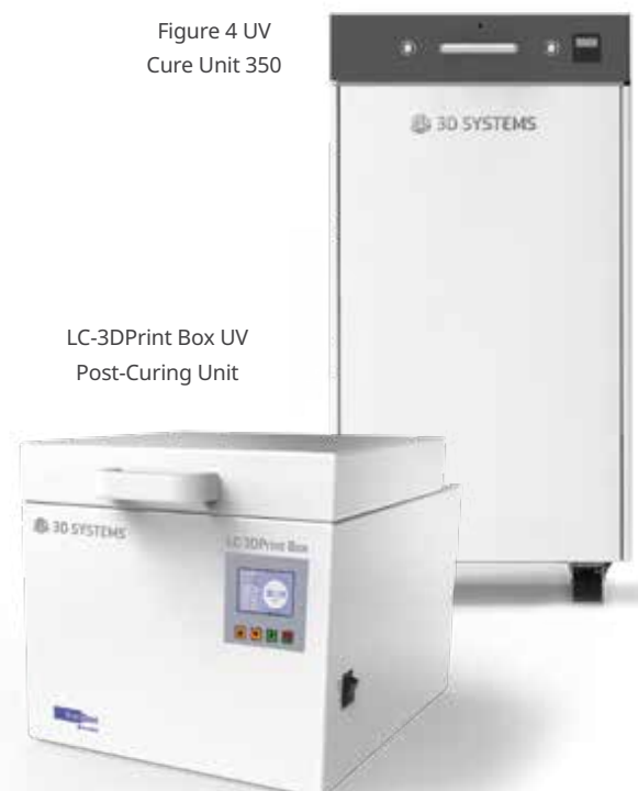
LC-3DPrint Box UV Post-Curing Unit