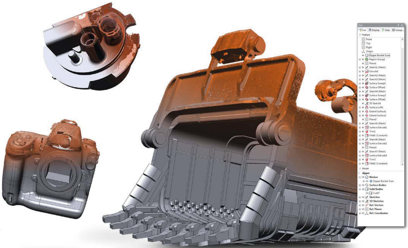
A parametric solid models created in Geomagic Design X

Save significant money and time when modeling as-built and as designed parts. Deform an existing CAD model to fit your 3d Scans. Reduce tool iteration costs by using actual part geometry to correct your CAD and elimination part springback problems. Reduce costly errors related to poor fit with other components.